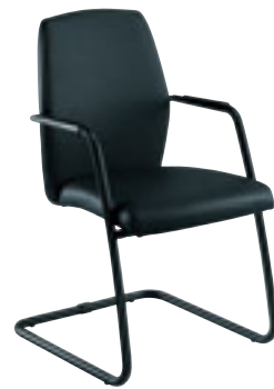
② Cantilever chair