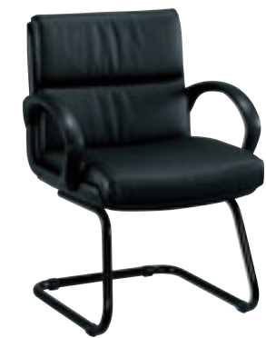
② Cantilever chair