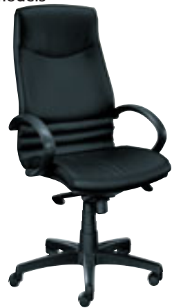
① President chair