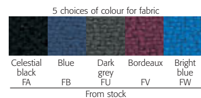
5 choices of colour for fabric