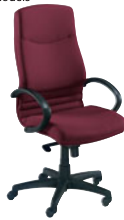
③ President chair