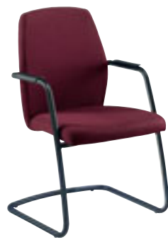
④ Set of 2 cantilever chairs