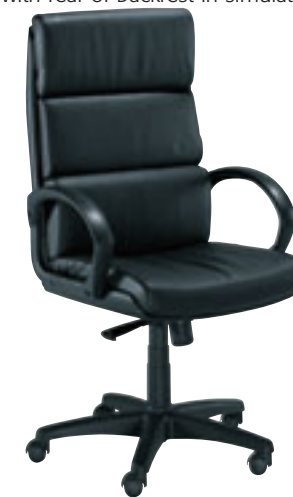
① President chair