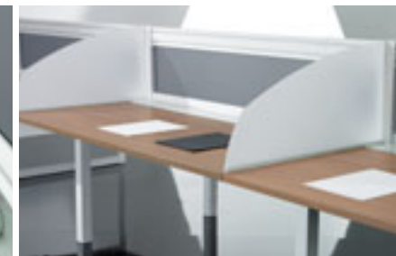
Side screens in white alutglass