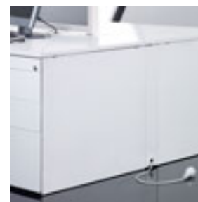
Cable storage kit with upper or lower port

The Bench System combines a range of flexible storage units with the potential to accessorize.