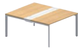
W.140 x D.165 cm