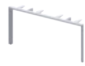
W.165 cm "Bridge"