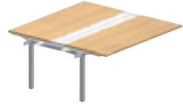
W.160 x D.165 cm