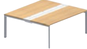
W.180 x D.165 cm