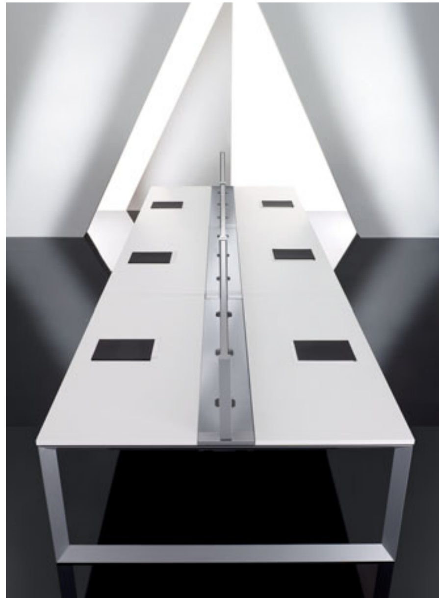
Extremely flexible linear configurations. Neat, well-ordered workstations make optimum use of space and are ideal for offices in which workers are constantly on the move.