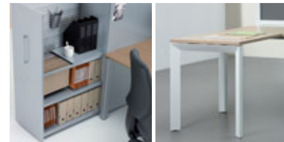
Tower pedestal: half pedestal, half cupboard