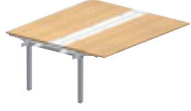
W.180 x D.165 cm