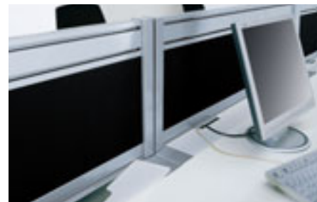
Easy access to cables and sockets via the removable cover

The bench system promotes and encourages teamwork, one of the key motivating factors in the modern office.