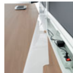
Large capacity cable trough