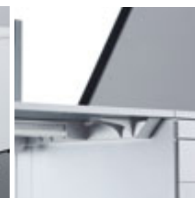
Link to connect pedestal/tops/beam